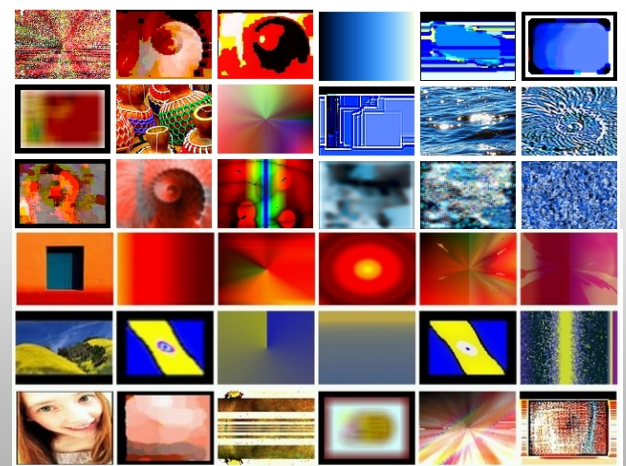
A few results of bucketized color count fitness function. In the top three rows, Flickr reference image appears in the center of each grid. In the bottom three rows, Flickr reference image is the first image on the left.